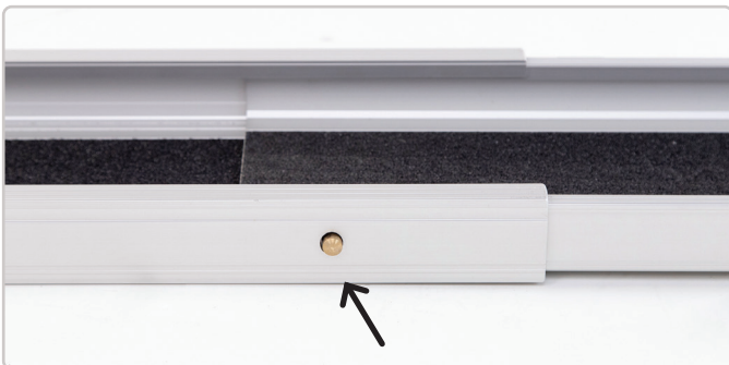
3. Locate the latch into the securing position.