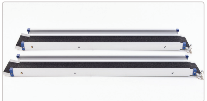
4. Repeat steps on other ramp.

Place the ramps the required width apart ensuring they are parallel.