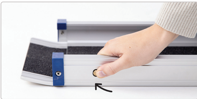
1. Press the latch to release the ramp.