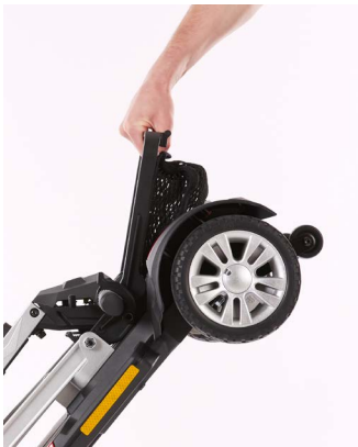
Lift & Carry