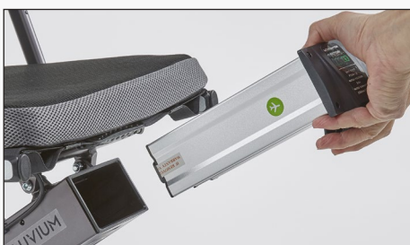
Off board battery charging