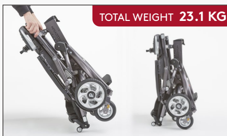
Folds and transports easily